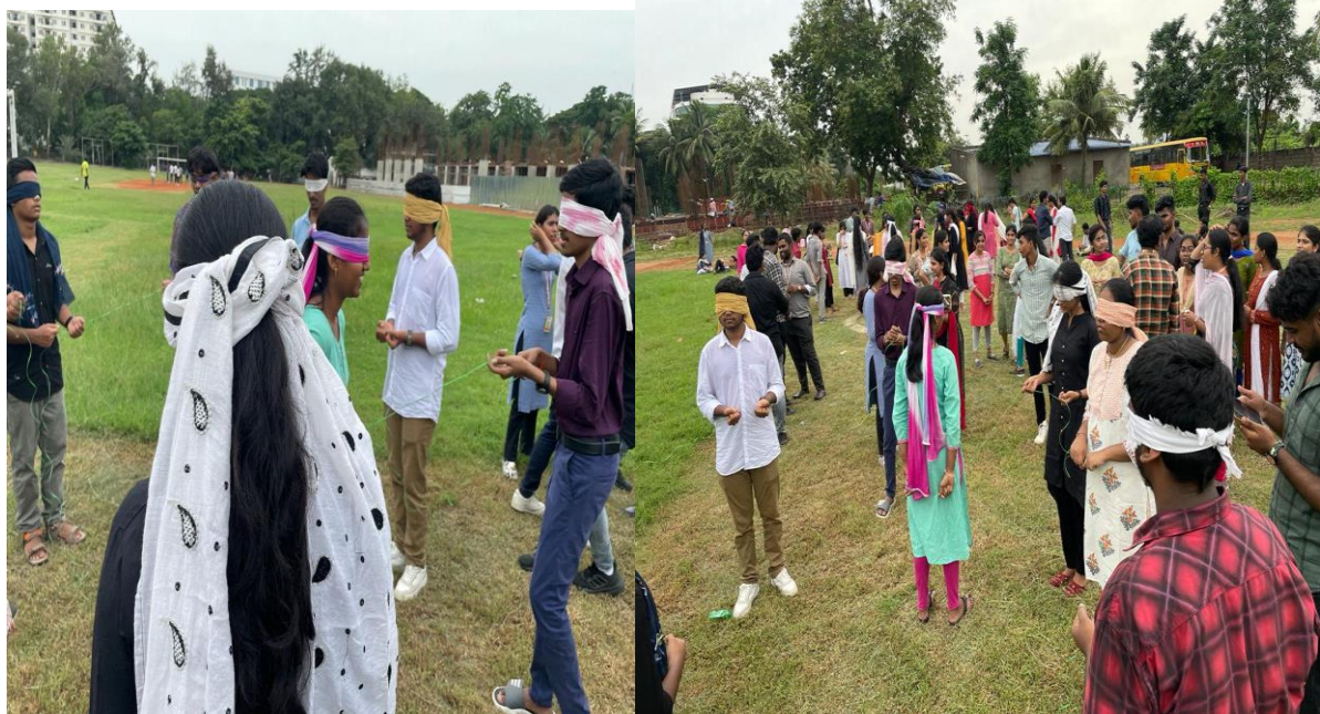
Professional society activity: Lead the team: Event pics on 21-09-2023