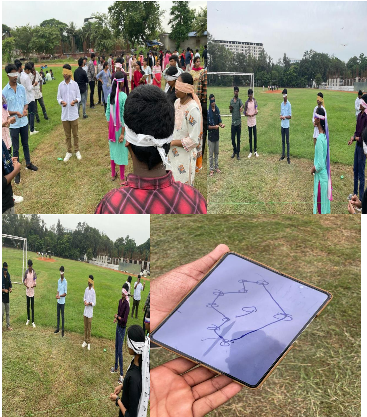
Professional society activity: Lead the team: Event pics on 21-09-2023