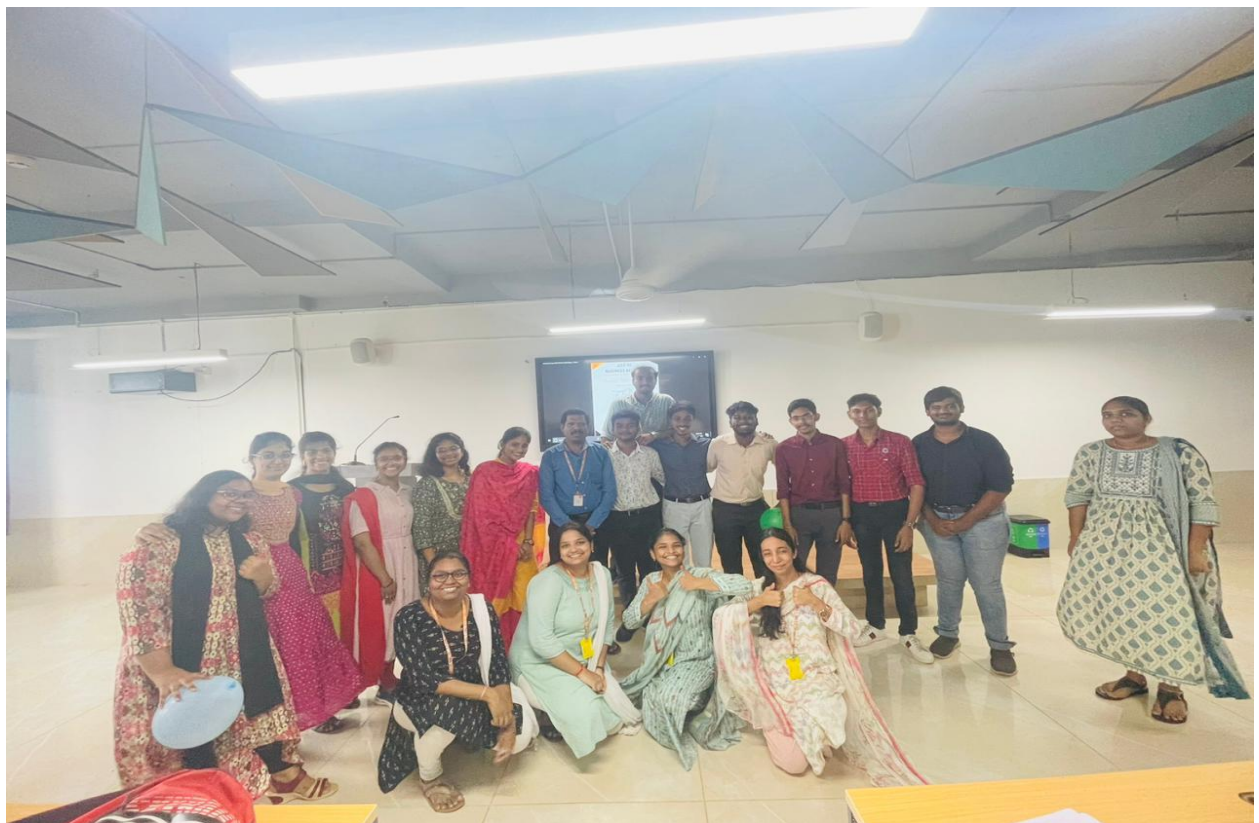
Professional society activity: Lead the team: Event pics on 21-09-2023