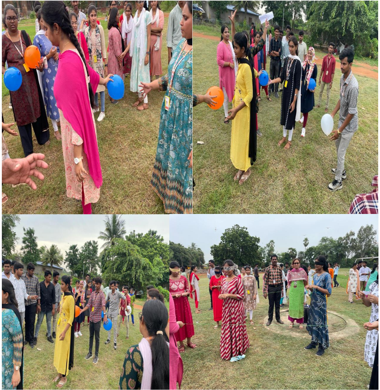
Professional society activity: Lead the team: Event pics on 21-09-2023